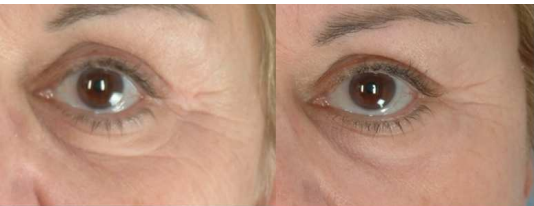
Before 3.0 J med pulse, 2 treatments After